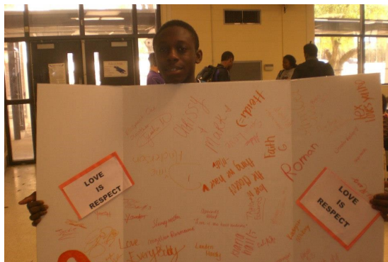
Darlington High School student with Love is Respect Project, created by attendees of our Youth Leadership Summit.