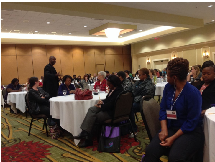
Byron Hurt - Hip-Hop: Beyond Beats & Rhymes