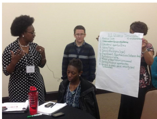
Attendees of our 2013 Annual Sexual Assault Awareness Month Conference discuss privilege.