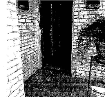
One no-step entrance (may be at the front, side, back or garage entrance).

Open living spaces providing ample room for maneuvering and allowing good visibility throughout the house.